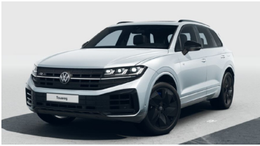
Oyster Silver Metallic