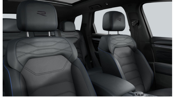
Optional "Puglia" leather Soul Black