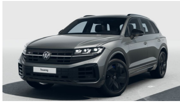
Silicon Gray Metallic