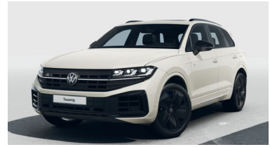
Sechura Beige Metallic