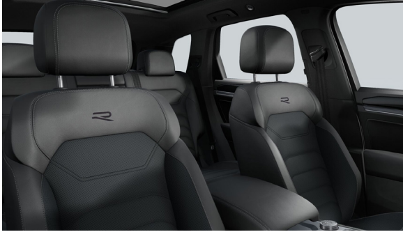
"Vienna" leather R eHybrid Soul Black - Crystal Grey