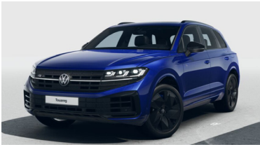
Lapiz Blue Metallic*