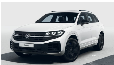
Oryx White Pearl Effect