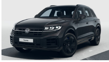
Grenadilla Black Metallic