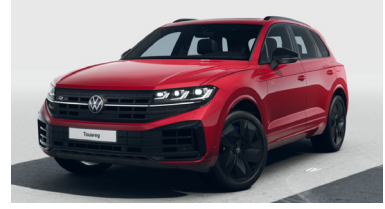
Chili Red Metallic