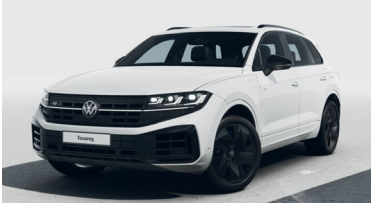
Pure White Solid