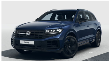
Meloe Blue Crystal Effect